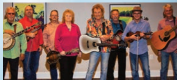
Eddy Raven's Acoustic Country Grass Show Saturday