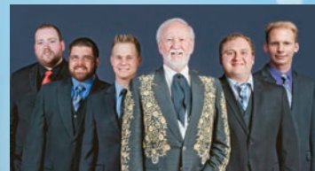
Doyle Lawson & Quicksilver Thursday

Ramada Inn & Smoky Mountain Convention Center 4010 Parkway, Pigeon Forge, TN Wednesday, Thursday, Friday & Saturday December 6-9, 2017