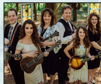
WILLIAMSON BRANCH Thursday