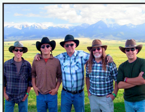
NOTHIN' FANCY Saturday