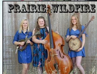
PRAIRIE WILDFIRE Thursday