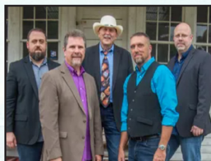
DEEPER SHADE OF BLUE Saturday