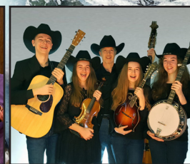
MOUNTAIN HIGHWAY Saturday