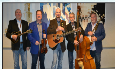
FAST TRACK Friday