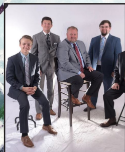
THE KING JAMES BOYS Friday